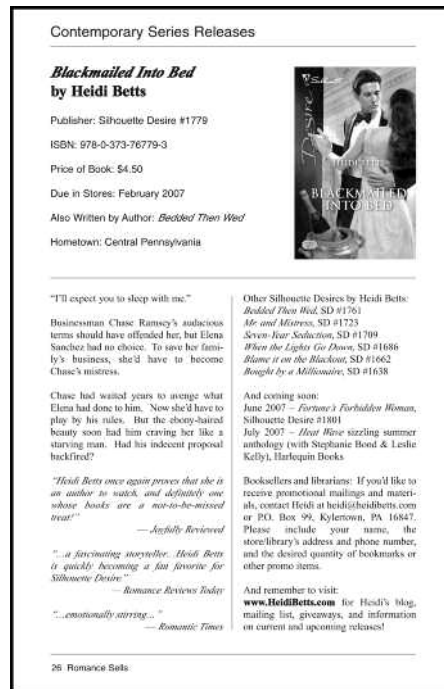
Design Option 2