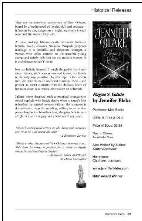
Design Option 1